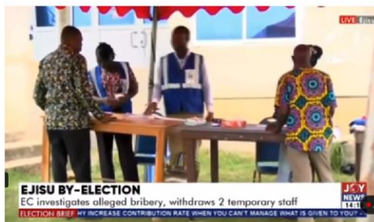
EJISU BY-ELECTION EC investigates alleged bribery, withdraws 2 temporary staff