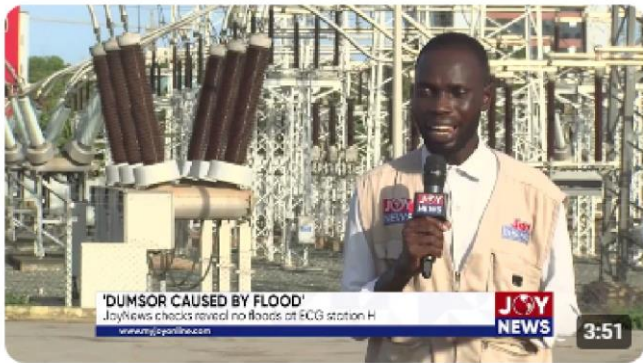
'Dumsor caused by flood': JoyNews checks reveal no floods at ECG station H

After the news came out that there were no floods the utility decided to put spin on the situation.