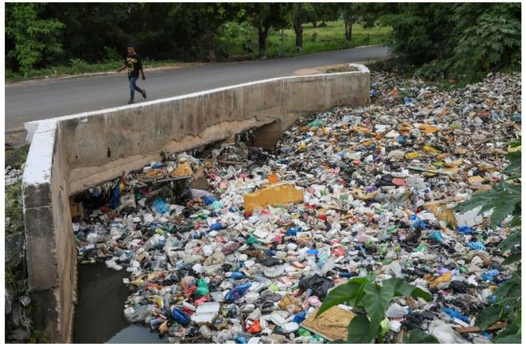
A pedestrian walks along a bridge over a gutter, blocked by plastic waste and garbage, in Accra, Ghana.

People here throw plastic on the ground.