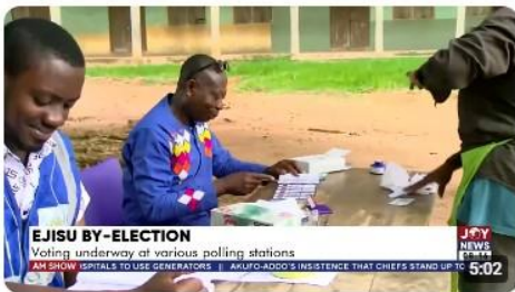
Government officials are engaging in vote-buying activities in Bonwire - Nana... JoyNews 653 views • 2 hours ago