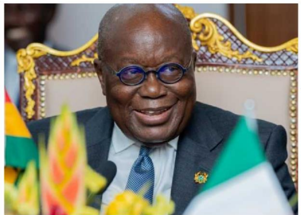
Advertisement President Nana Addo Dankwa Akufo-Addo has assured the people of Ghana that they will not experience the erratic power supply (Dumsor) that occurred under the Mahama administration, again.

You can imagine the surprise when four days ago the president announced that the reason we have been having so many problems was because of electrical generation station work the previous (over 7 years ago) administration had not finished.