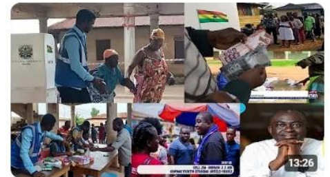
Look the money we got, Aduomi pay GHc15000 for votes as NDC...