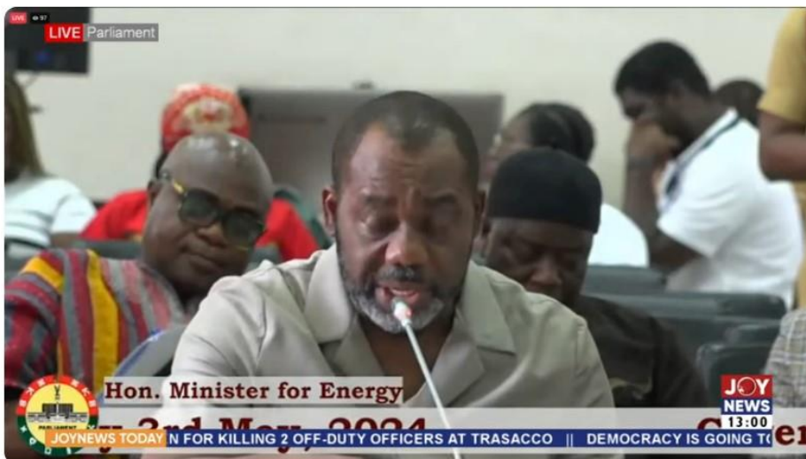
We are in the era of 'dum sie sie', different from 'dumsor' - Energy Minister, Matthew Opoku Prempeh

Since the announcement on May 1st, I have been overjoyed at how many repairs the government is making.