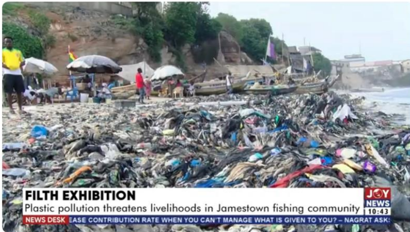
Filth Exhibition: Plastic pollution threatens livelihoods in the Jamestown fishing community

Local fishermen are now reporting they are catching more pollution than fish in their nets.