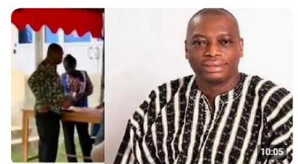
This is the alleged NPP MP who was caught on camera bribing the EC official... MELODIES TV 1.9K views • 9 hours ago

While cameras were rolling at the last regional election with the delegates being paid for their attention, one politician was seen (on camera) giving an envelope to the electoral commission authorities who tabulate the results. They did not accept his envelope and he left it at their station and walked away. When the evidence of him trying to bribe the vote tabulators was seen there arose an immediate outrage that someone was trying to bribe officials.