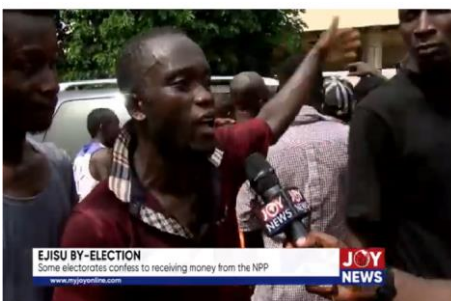
EJISU BY-ELECTION Some electorates confess to receiving money from the NPP